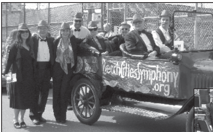
Above: Orchestra and Board Members participate in the 2013 Hermosa Beach St. Patrick's Day Parade.

OUR MAY CONCERT WILL ALSO FEATURE: Overture to La gazza ladra --Gioacchino Rossini (Facebook Audience Choice) Slavonic Dances #'s 2 & 8—Antonín Dvořák