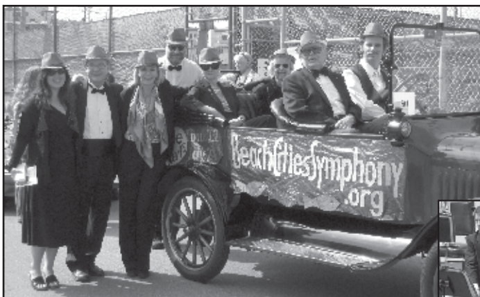
Above: Orchestra and Board Members participate in the 2013 Hermosa Beach St. Patrick's Day Parade.

OUR MAY CONCERT WILL ALSO FEATURE: Overture to La gazza ladra --Gioacchino Rossini (Facebook Audience Choice) Slavonic Dances #'s 2 & 8—Antonín Dvořák